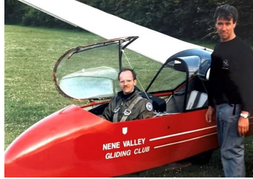
Another day, another trainee